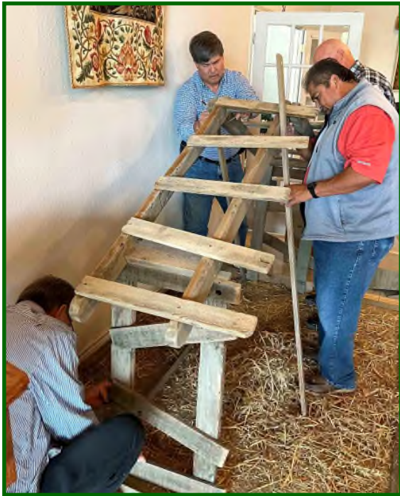
The Nativity "Crew" tackles the Shed